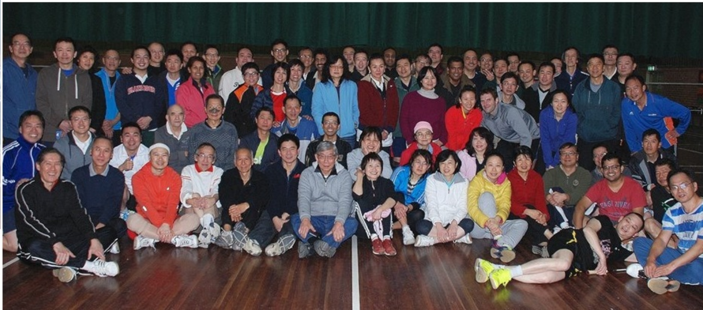
Players and volunteers for the Graded Tournament in July 2015