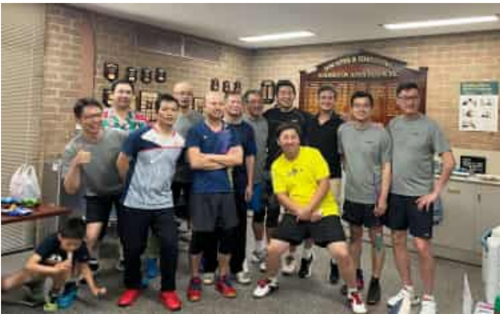
A photo of the coaching team in December 2024.

For members who are passionate about helping young children develop the basics of badminton and promoting the sport to our future generations, please speak to any of the coaches or committee members, or contact coach@dtba.org for more information.